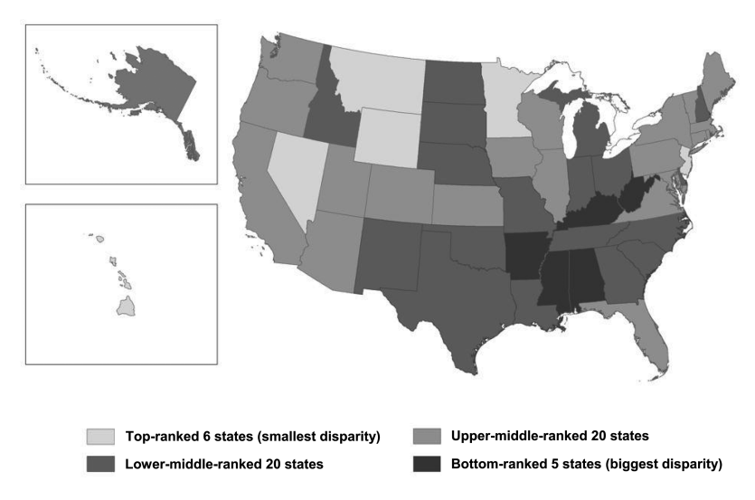
FIGURE 3. State ranking of overall disparity in functional limitation, 2009.

Notes : 1. "No functional limitation" is defined as not having a limitation in any of the following six areas: hearing, vision, cognition, ambulation, self-care, and independent living.